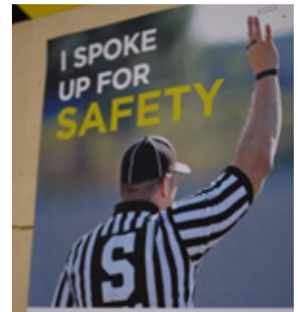
St. Vincent's encourages caregivers to speak up about safety.

During the first year, patient handling injuries decreased 56 percent, and they continue to decrease: from 2012 to 2013, the hospital saw a 27 percent reduction. The success of the current program is also due to management commitment and transparency. Senior executives lead daily safety huddles, and "good catches" (i.e., reported near misses) are treated as opportunities to learn additional ways to improve safety.